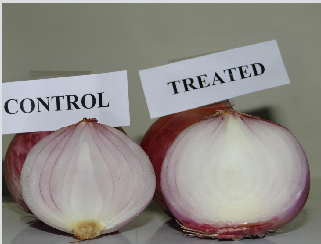
Fig 2: Texture of onion bulb of control and treated plants

PW- Plant weight (g), PL- Plant length (cm), NOR- No. of root (nos.), RL- Root length (cm), NOL- No. of leaves (nos.), LL- Leaves length (cm), LW- Leaves weight (g), BW- Bulb weight (g), DB- Diameter of bulb (mm), DN - Diameter of neck (mm).